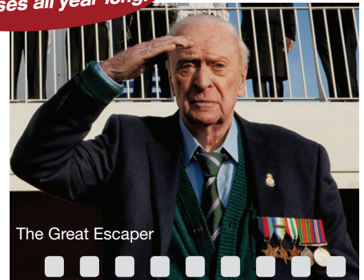
The Great Escaper